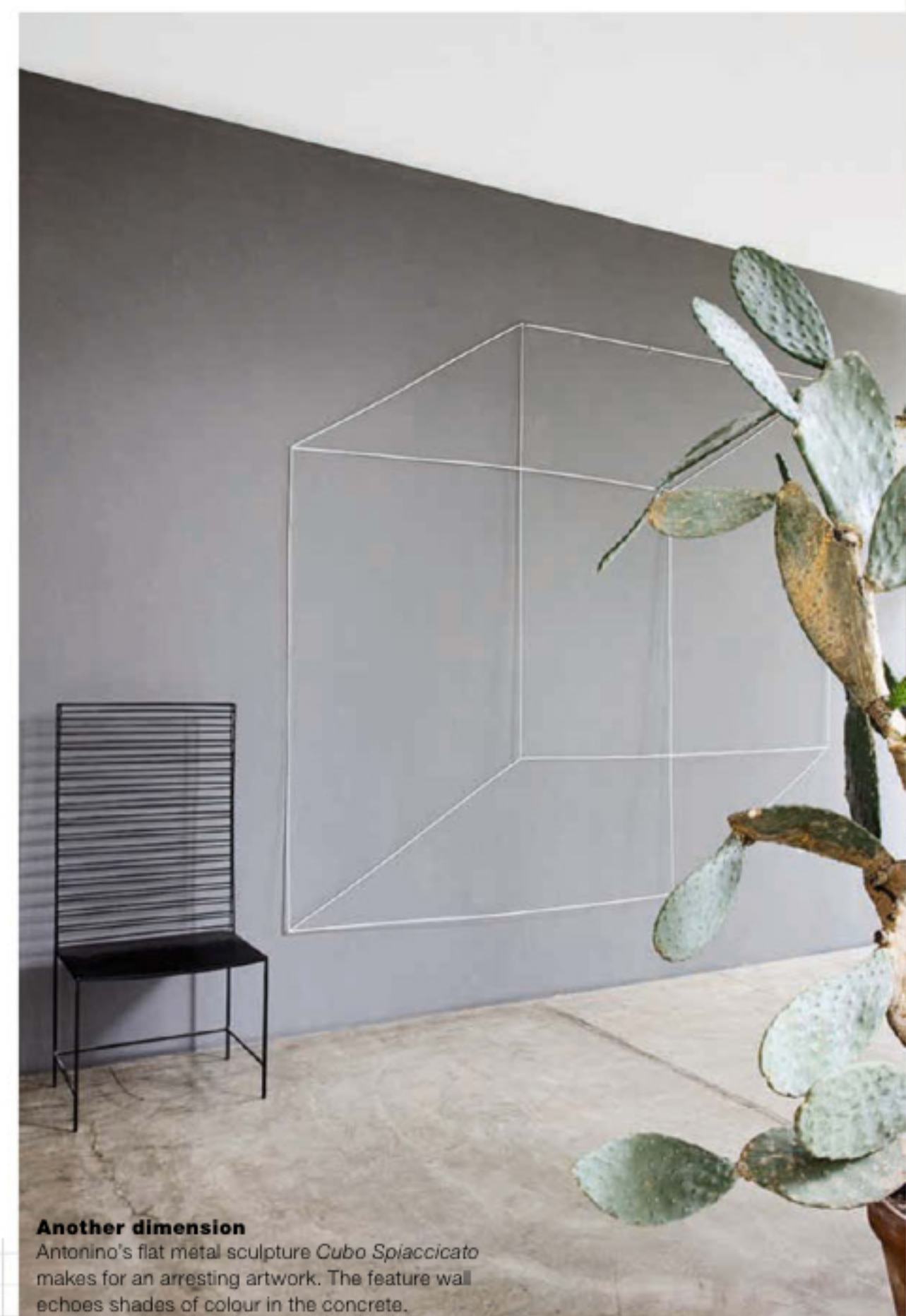
Another dimension Antonino's flat metal sculpture Cubo Spiaccicato makes for an arresting artwork. The feature wall echoes shades of colour in the concrete.