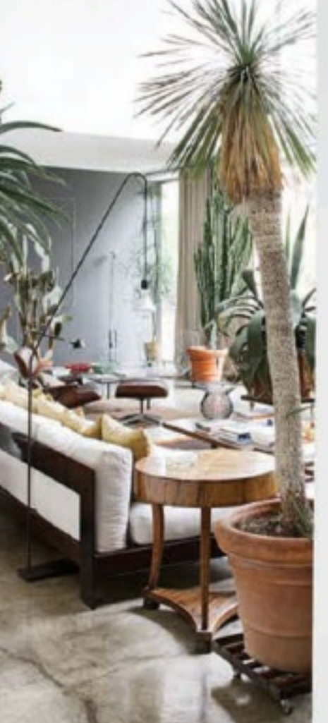
Sum of its parts A naive maths artwork by Antonino, titled Matematico Infantile , adds a simple, quirky touch to the organic but sophisticated space. It also provides a subtle nod to the property's previous life as a workshop for calculator parts.