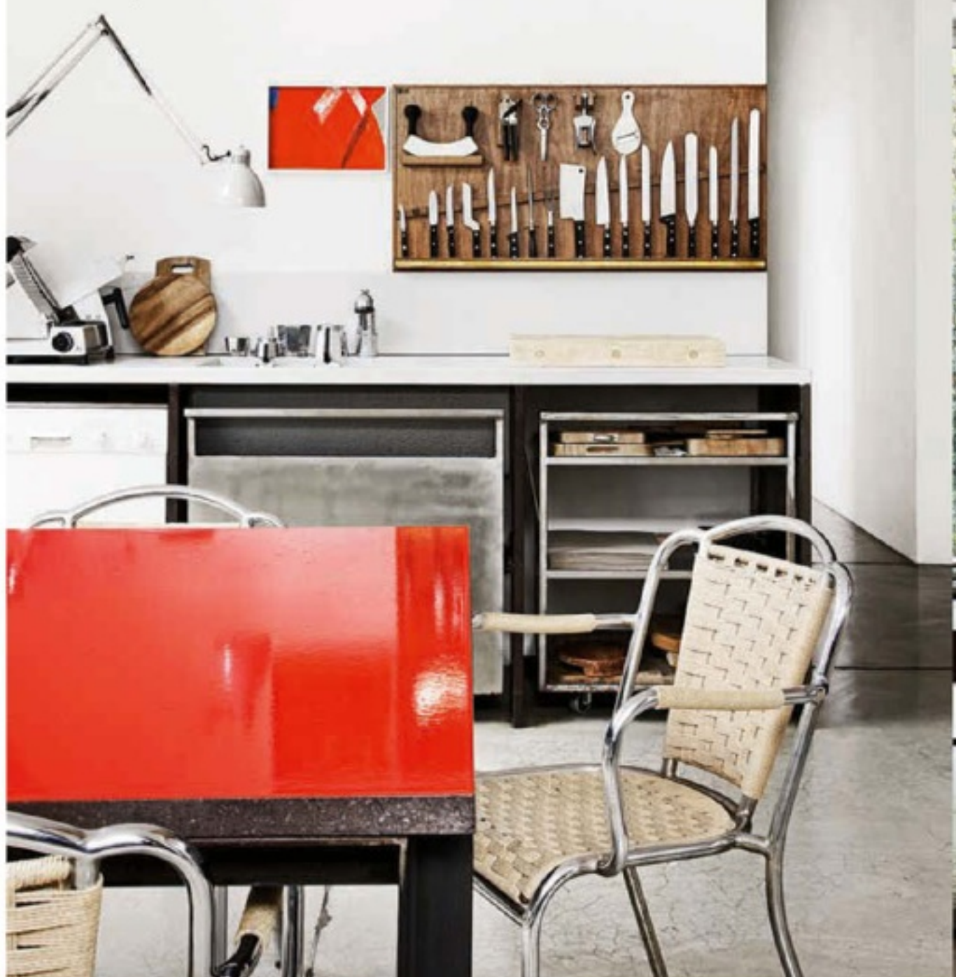
Lava flow The kitchen has a very industrial minimalist feel, although a vivid red lacquered stone table adds a dramatic splash of colour.