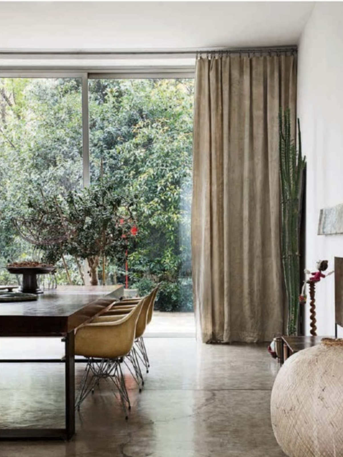
Country air Despite living in the city, the lush garden viewed through the large windows makes Antonino feel like he's residing in the country.