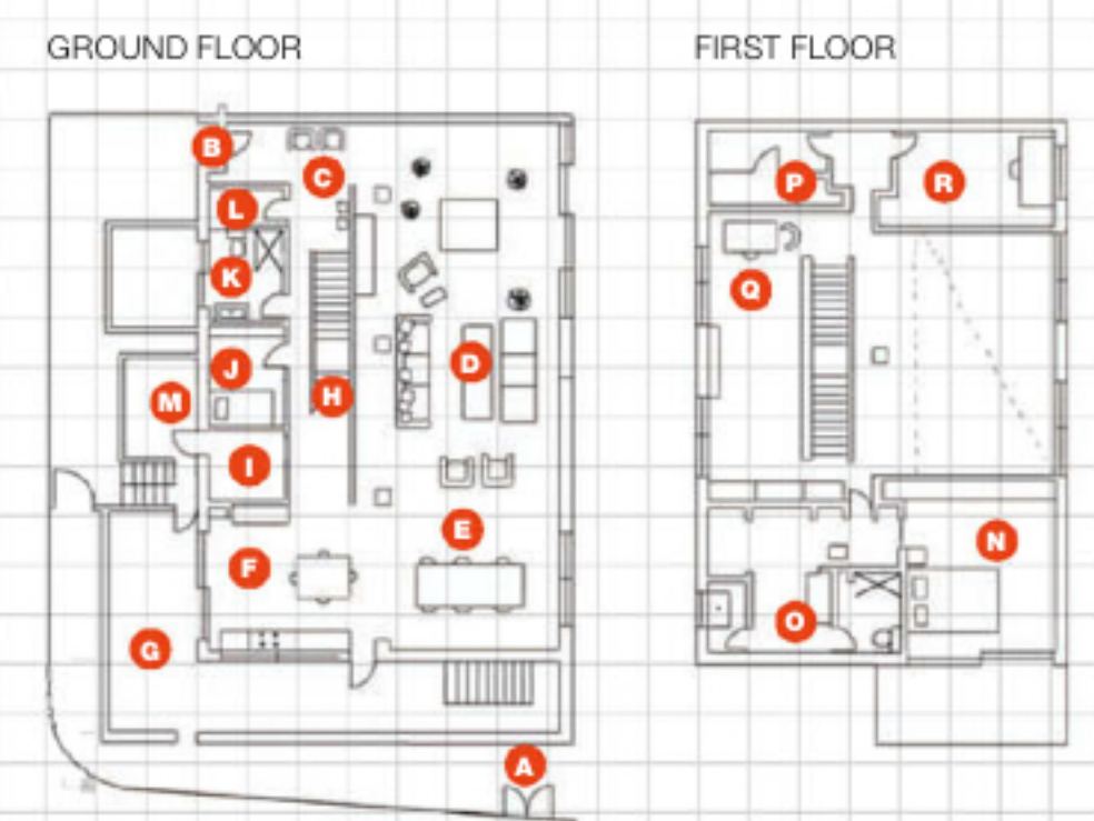
KEY A Gate entrance B Home entrance C Hallway D Living area E Dining F Kitchen G Courtyard H Stairs I Laundry J Guest bedroom K Guest bathroom L Wardrobe M Workshop N Master bedroom O Ensuite P Wardrobe Q Office R Spare room

affordable and easy to maintain, and the gorgeous random flecks of different shades of taupe, grey and beige give it a warm and rustic look. WINDOW WOW Adding to the sense of spaciousness in the home is the light that floods into the living area – and upstairs landing – from the massive two-storey windows, making the space feel like an atrium. The windows also optimise the view of the lush garden, which, combined with the inclusion of plants in the interior, gives Antonino the feeling of being “immersed” in nature – which he loves. HOME GALLERY While the generous living area on the ground floor – characterised by its lofty, void-like ceiling – has been decorated in a simple but sophisticated way for comfortable lounging, the cool, minimal style also suits the large room’s dual purpose as a showroom. Here, Antonino’s pieces – which are also exhibited in several galleries – sit in perfect harmony with classic furniture and lighting designs. On the ground floor, too, is the dining area and kitchen, while upstairs is the glorious landing, bedroom, bathroom and office, with a similar feeling of light and space. The former calculator-parts factory adds up to a fabulous multifunctional home – and for Antonino, it was an excellent score! 🏠