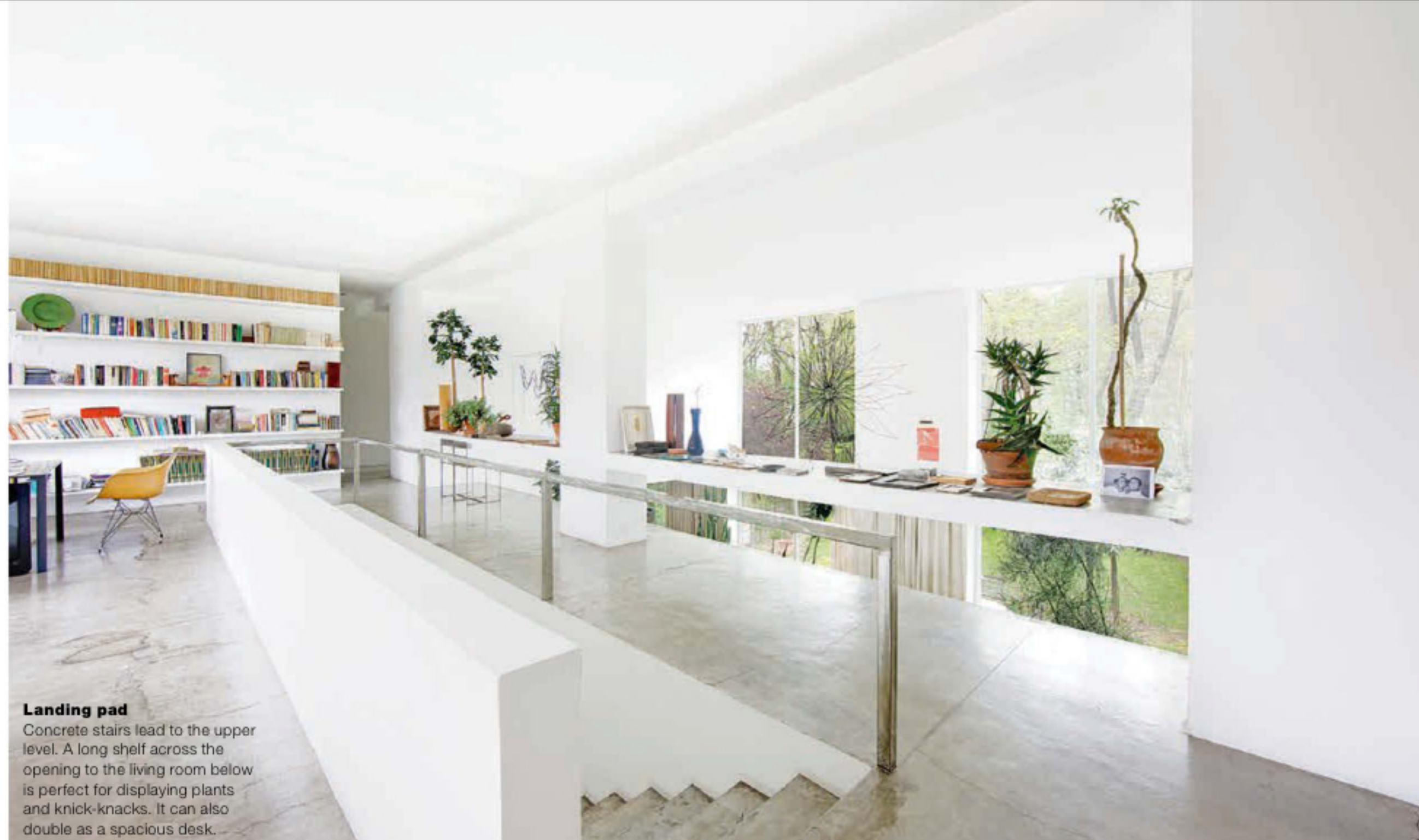
Landing pad Concrete stairs lead to the upper level. A long shelf across the opening to the living room below is perfect for displaying plants and knick-knacks. It can also double as a spacious desk.

LARGE OPENINGS IN THE INTERNAL WALL OF THE LANDING ALLOW LIGHT FROM THE LIVING ROOM WINDOWS TO FLOOD INTO THE AREA, ENHANCING THE FEELING OF SPACE